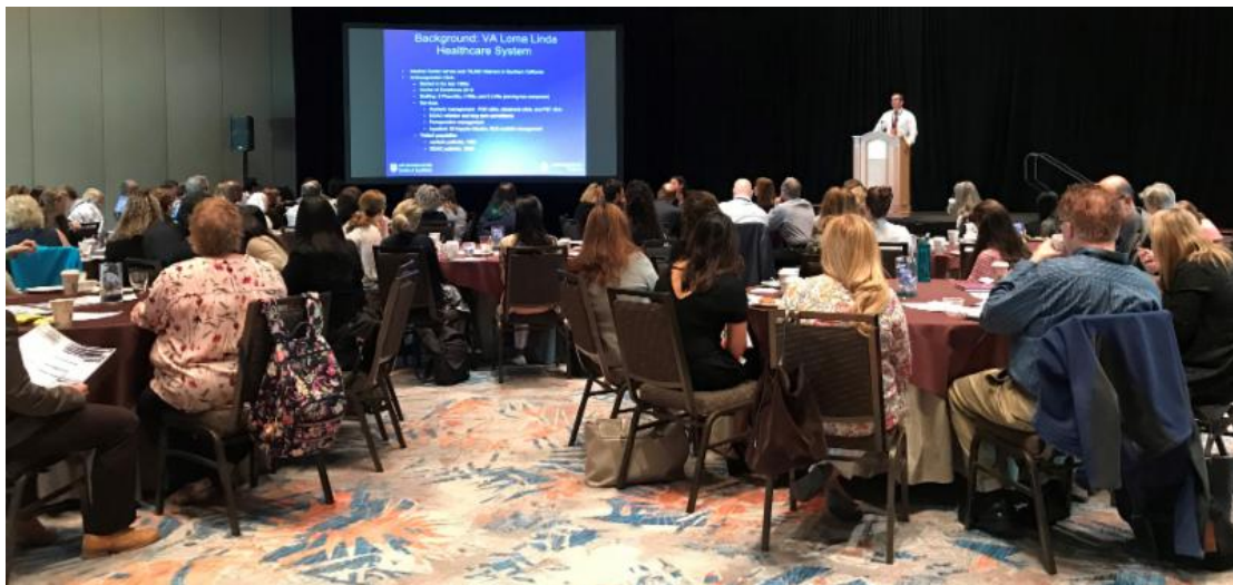
A full house at our Anticoagulation Centers of Excellence (ACE) breakfast workshop where attendees learned more about how to earn the ACE designation for their practice.